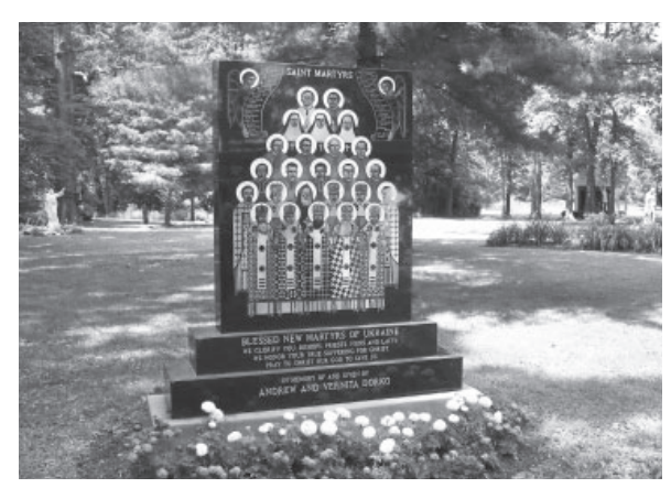
A beautiful shrine honoring the Ukrainian martyrs can be found at the Sorrowful Mother Shrine.

Two hundred invitations were sent out to graduates to attend the GradFinale. There was a change from previous years and everything was conducted with one-stop shopping on the first floor so that stu-