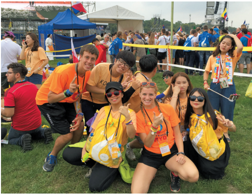
Youth from Glandorf meet young Catholics from Korea at World Youth Day in Krakow.