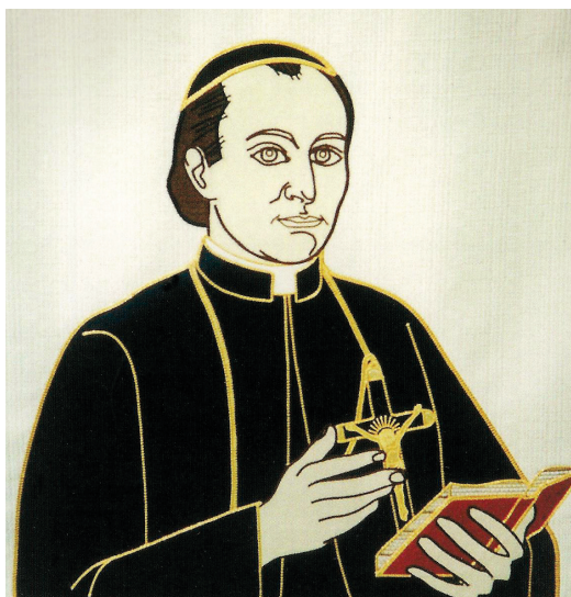
St. Gaspar del Bufalo