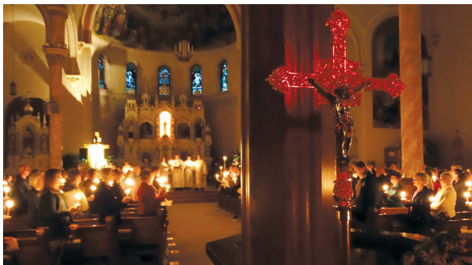
A parish mission at Immaculate Conception Church in Celina, Ohio, uses candles to set faith on fire.

Preaching parish missions was one of the first ministries of the C.P.P.S. Parish missions have changed a lot in 200 years—but much about them remains the same.