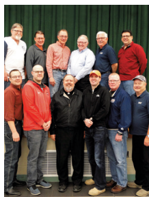
The men's group at Sts. Peter and Paul in Ottawa, Ohio.