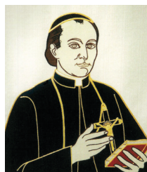
St. Gaspar, founder of the C.P.P.S.