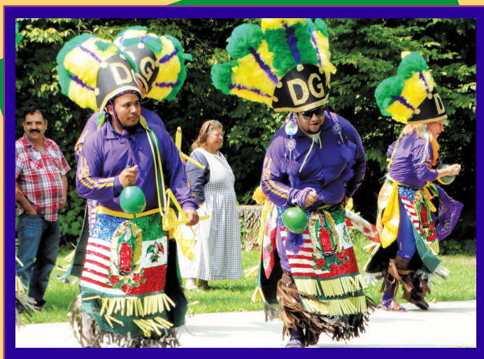
Members of Danza Guadalupeana of Norwalk, Ohio, take part in a procession on Hispanic Sunday.

Pilgrimages at the Sorrowful Mother Shrine help the faithful celebrate their spiritual inheritance